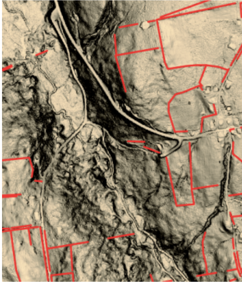
One of Arvilla Dyer or Priscilla Allen's drawings on the back of one of their deed cards.