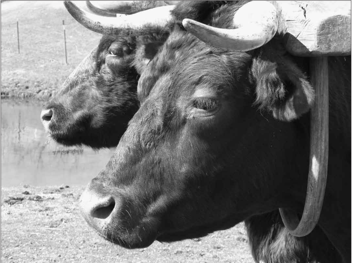
Wheel oxen need sturdy horns for bracing the yoke during a descent and for backing up a wagon.