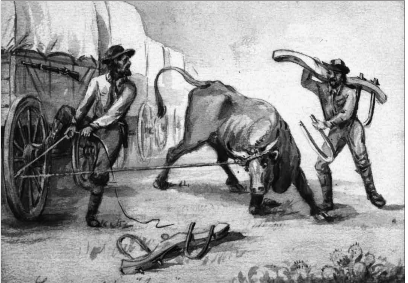
Yoking a Wild Bull, drawing, William Henry Jackson.