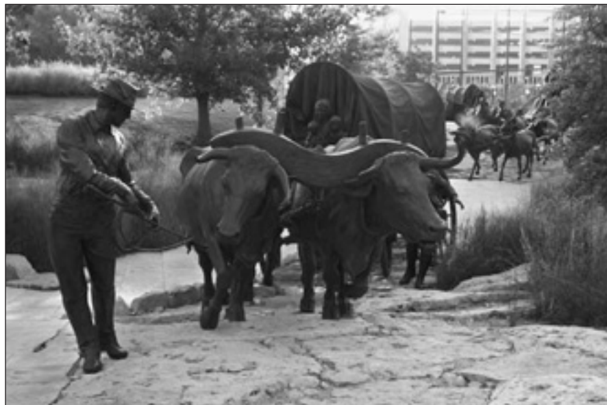
This view captures one of the central sculptures in Omaha's tribute to the pioneer emigrants who traveled west during the mid-nineteenth century. The 31-acre expanse in the heart of downtown Omaha includes two public parks, Pioneer Courage and Spirit of Nebraska's Wilderness, that celebrate both people and land. The oxen in this wagon train were modeled after Dixon Ford's own ox Thor.

killed them. "The worst enemy they had was dust," Ford says emphatically. "Dust killed more oxen than Indians or snakebites or anything else did." The reason has to do with the physiology of cattle.