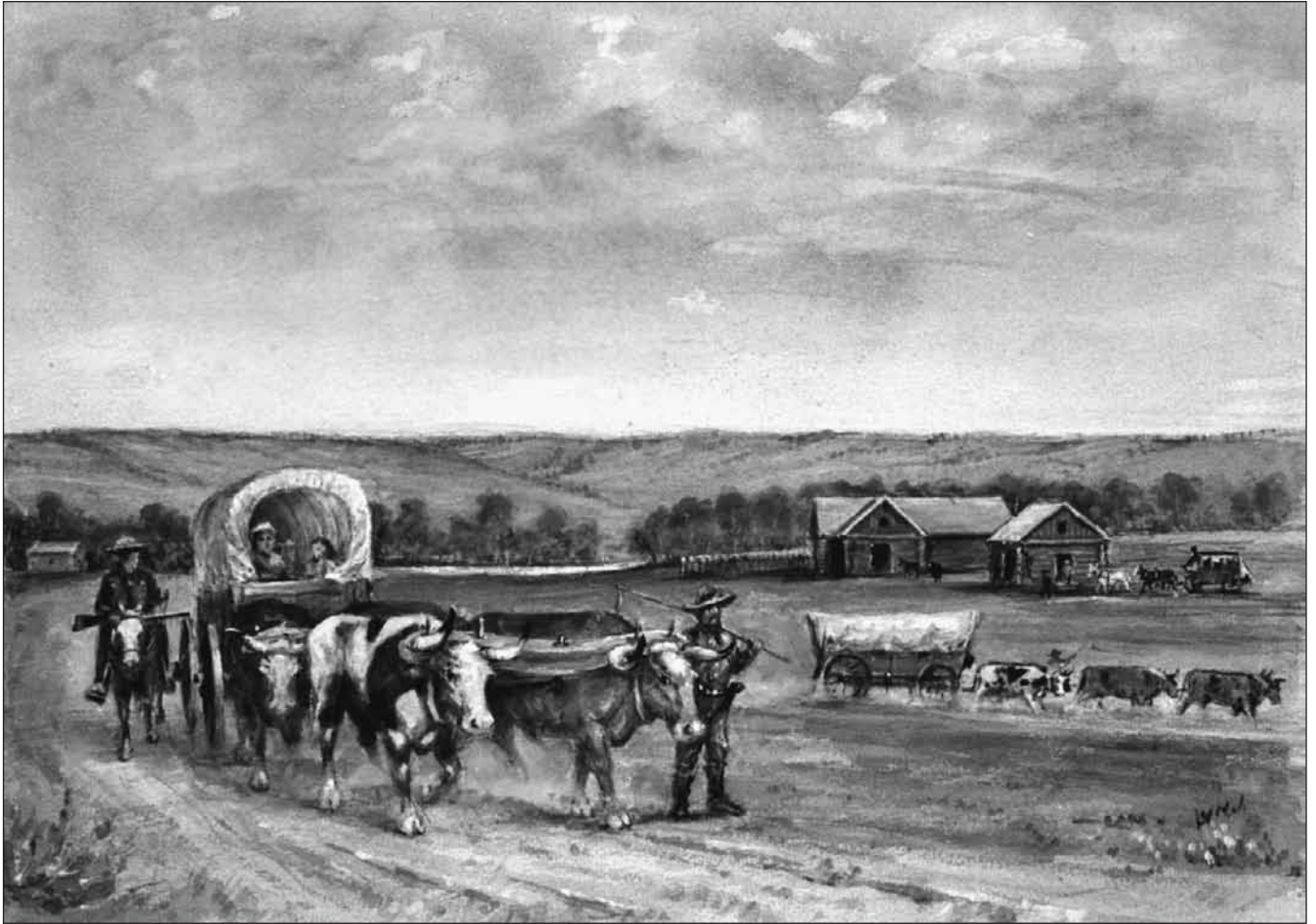
Rock Creek Station, painting (reversed), ca. 1859, by frontier artist, photographer, and bullwhacker William Henry Jackson. The ranch station, which stood on the California and Oregon Trails and the route of the Pony Express, is now a Nebraska State Historical Park, near the town of Fairbury.