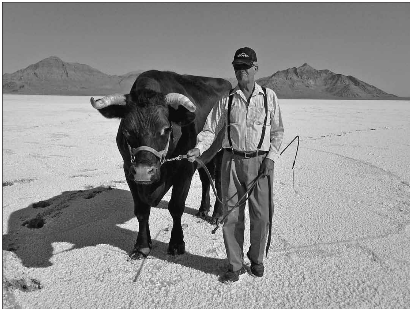
Oxen could endure lack of water during a desert crossing; it was the dust that killed them. This photo was taken at Utah's Great Salt Lake Desert during filming of Ford's documentary film about the Donner Party.